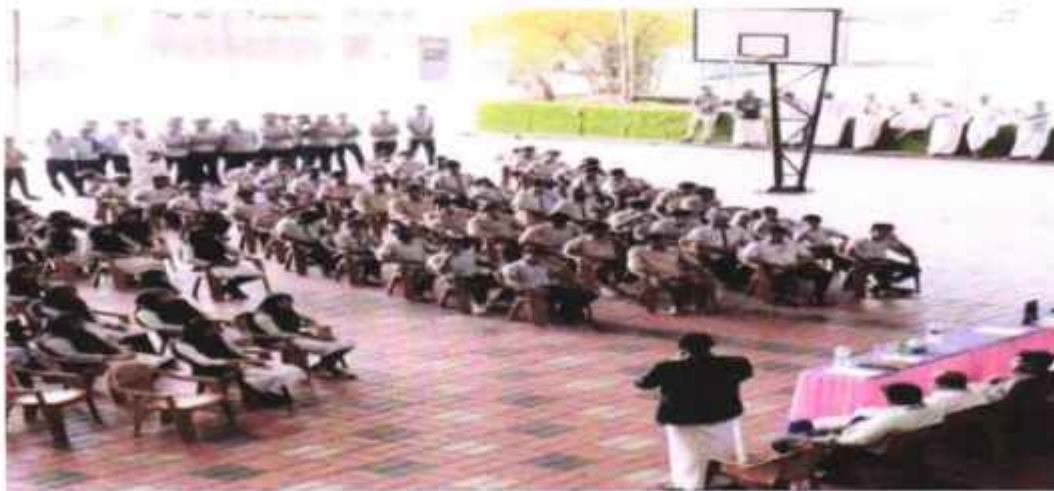
Students Engaged as the Extension Coordinator Highlights the Importance of Education.