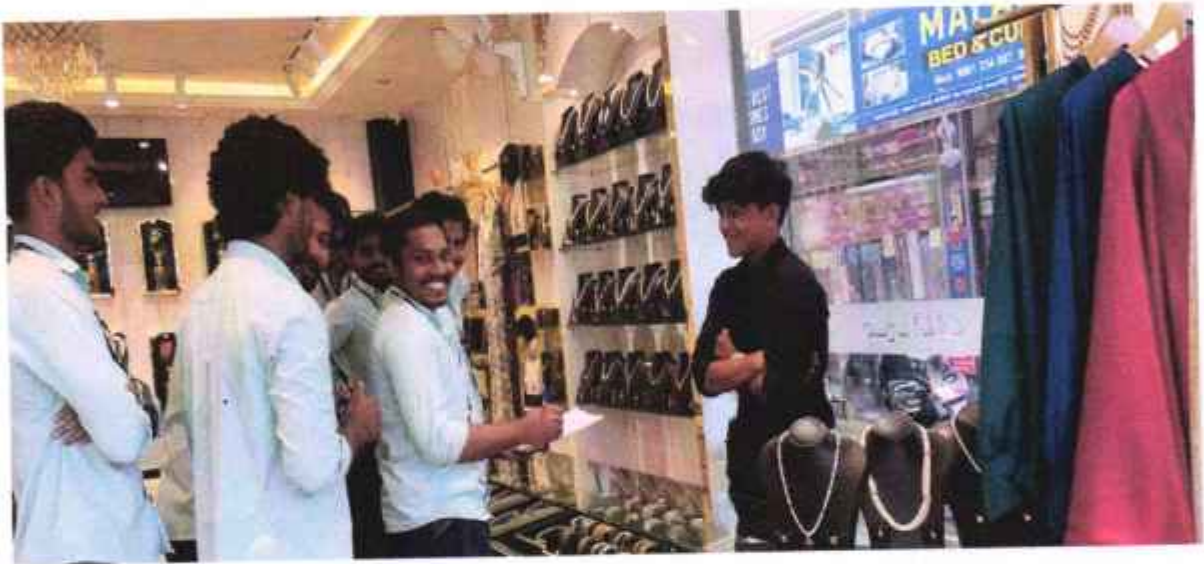
Students empowering shop owners and staffs with modern banking tools.