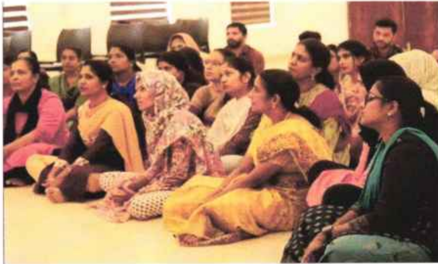
“Empowering Kudumbashree Women: Unlocking Potential through Entrepreneurship and Innovation.”