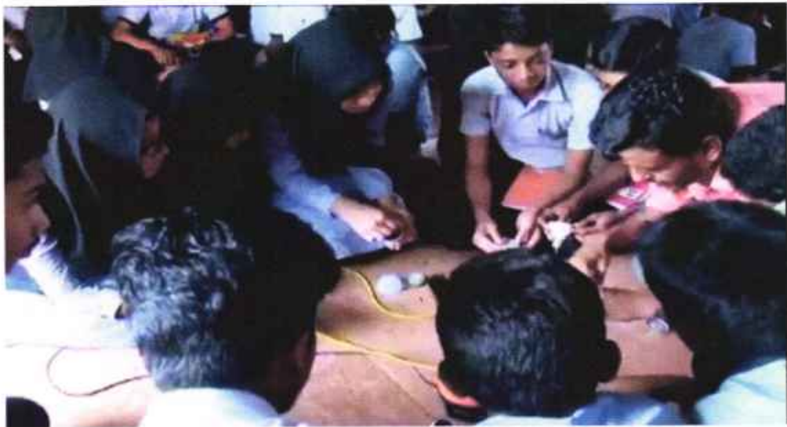
Students attending workshop