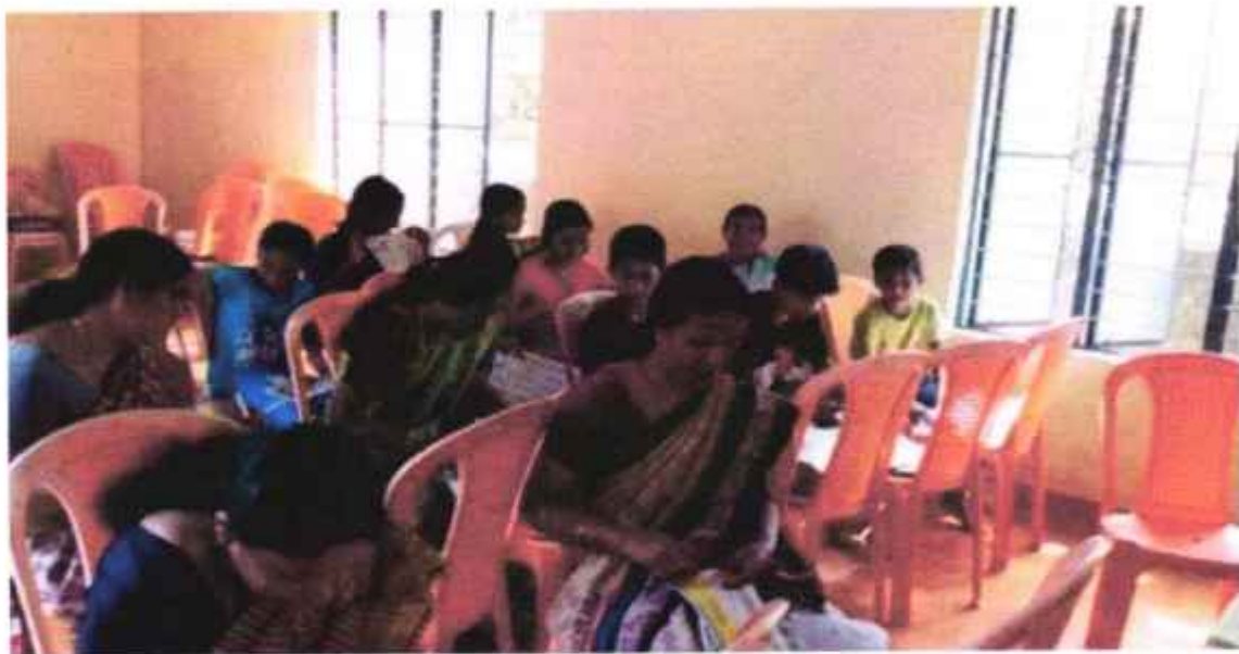
Kudumbashree members making paper bag