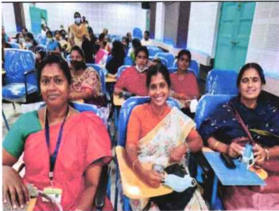
Kudumbashree Members Engaged in Learning During the Class