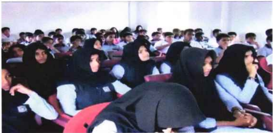
Students Attentively Observing a Program on Entrepreneurship and Innovation.