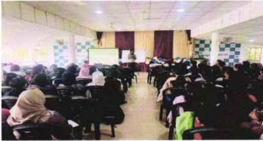
Strengthening Voices: Women Empowerment Initiative Inspires and Unites.