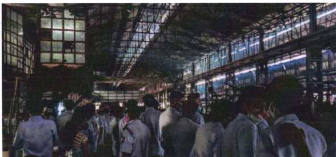
(Students seeing the process of steel manufacturing)