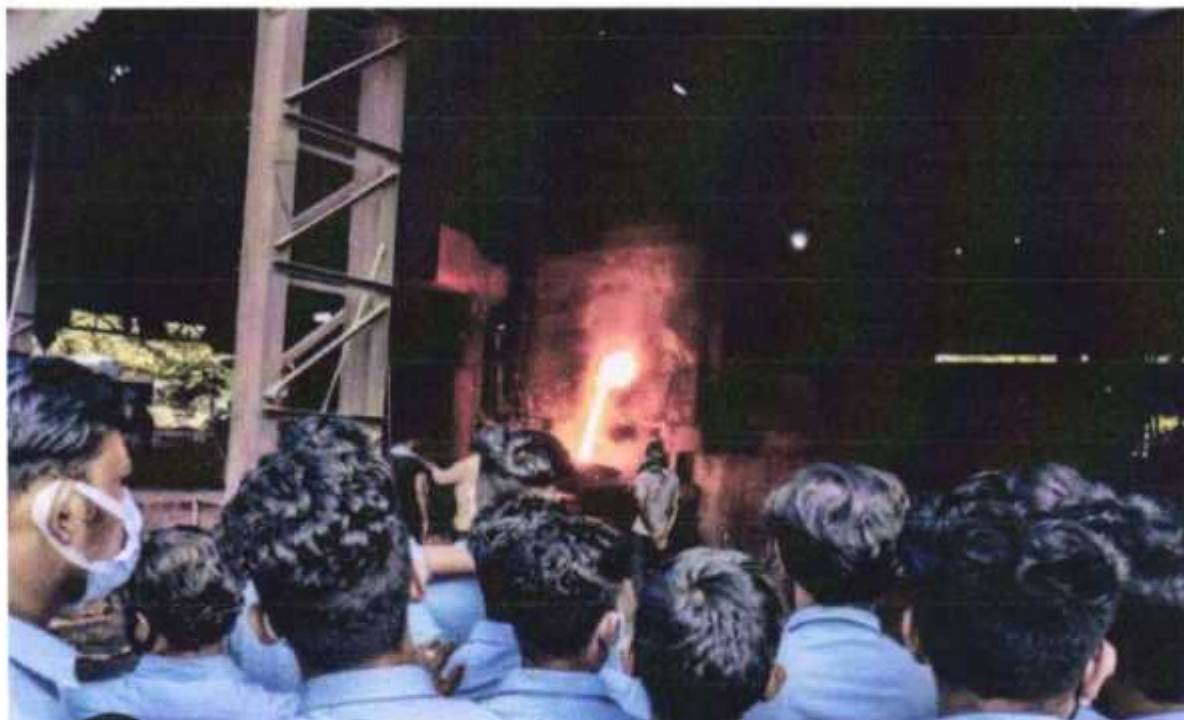
(Students visualising melting raw materials of steel)