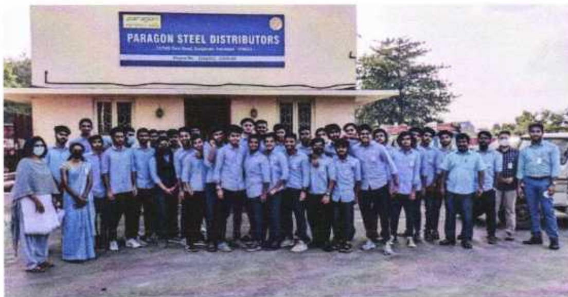
(Ed club members on paragon steel pvt .Ltd)